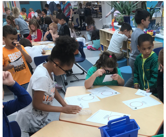
Hub space for grade-level and collaborative teaching

Lincoln School renovation designs also include innovative learning spaces, a central cafeteria, performance spaces, and dedicated pre-school classrooms to be completed in fall 2022.